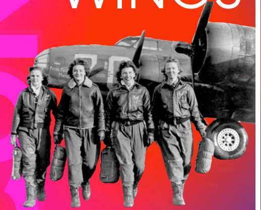
WOMEN AIRFORCE SERVICE PILOTS